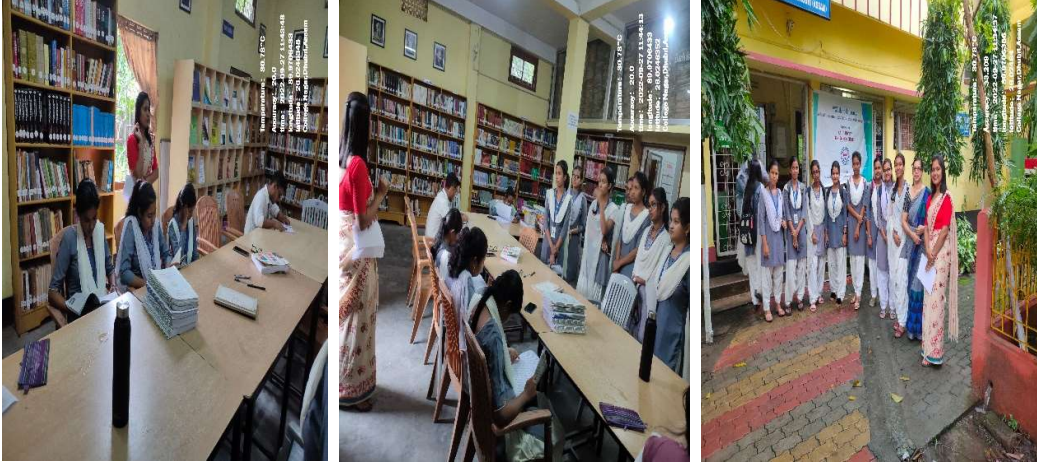
Students of B. A. Ist Semester Sanskrit Hons attending the Orientation Programme